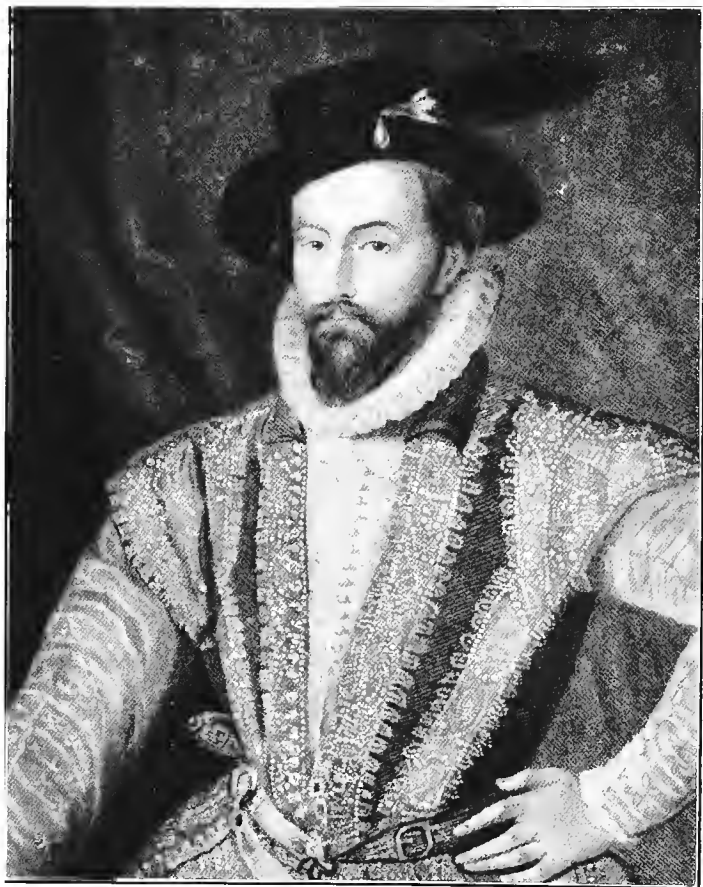
SIR WALTER RALEIGH

From a Painting in the Collection of the Duchess of Dorset